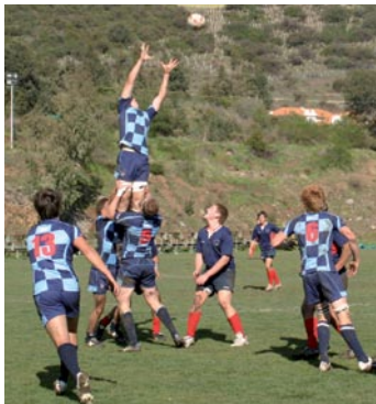
Rugby tour to South America

The season started early for 33 senior players who travelled to South America in August for a taste of rugby in the Southern Hemisphere, playing matches in Uruguay, Argentina and Chile and returning full of self-belief in readiness for the start of the new season. The 1st XV have since notched up some impressive wins against, among others, King's College School, Wimbledon and Epsom College. By the end of the first half of term, College