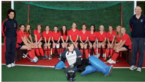
U14 Sussex champions

The U18 College hockey team are county champions for the ninth time in eleven years and the U14 girls have also picked up the county title – for the eighth time in ten years. Both teams recently represented Sussex in the regional round of the national competition and played with real character and passion against the best teams in the south, the 1st XI returning unbeaten. The 1st XI are at the semi-final stage of the U19 county competition, having lost just one game all season, and the U15s, whose single loss