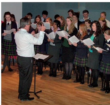
Choir practice in the Simon Eckert recording studio