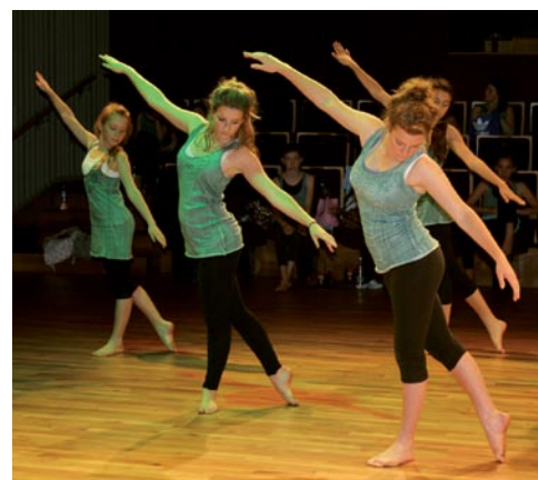
A Rambert Dance Company workshop