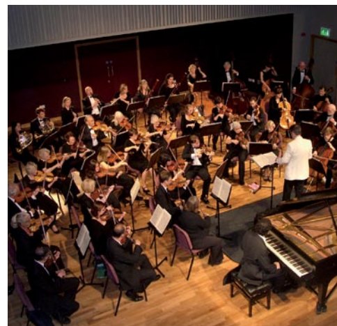
The Eastbourne Symphony Orchestra perform