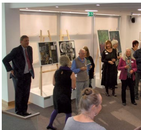
A reception for the Eastbourne Group of Artists