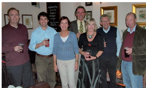
Some of the OEs who came along to the Dolphin in Eastbourne