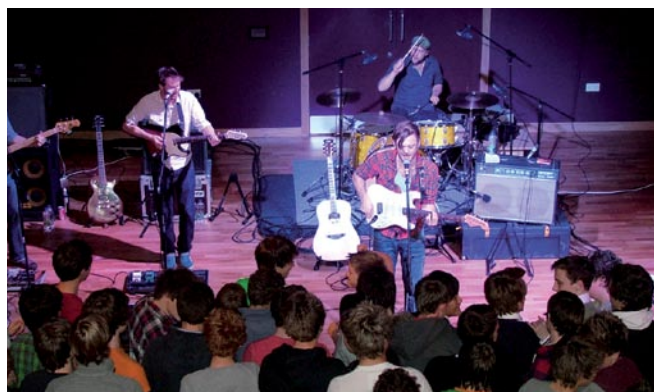
Yes Sir Boss