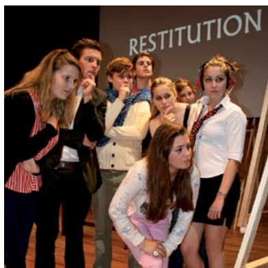
Lower Sixth actors in Restitution