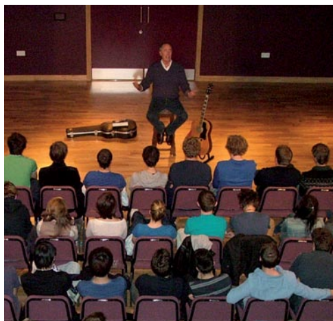
Sixties pop star Mike Hurst talks to the sixth form