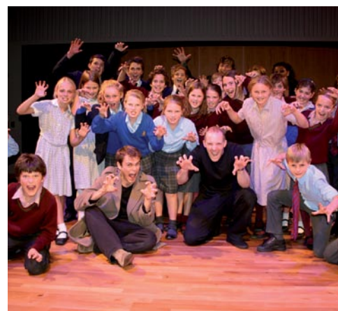
Prep school children enjoy a Vampirates workshop