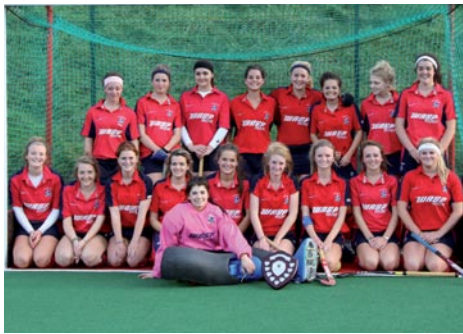
U18 Sussex champions

The U18 College hockey team are county champions for the ninth time in eleven years and the U14 girls have also picked up the county title – for the eighth time in ten years. Both teams recently represented Sussex in the regional round of the national competition and played with real character and passion against the best teams in the south, the 1st XI returning unbeaten. The 1st XI are at the semi-final stage of the U19 county competition, having lost just one game all season, and the U15s, whose single loss