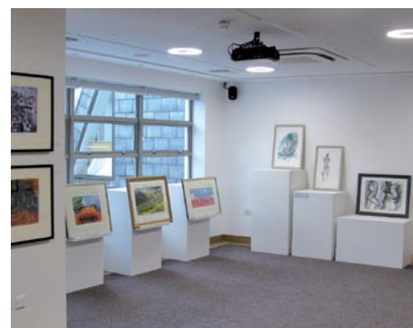
Plinths displaying artwork in the Birley Centre