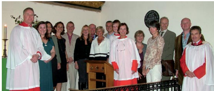
Some OE former choristers joined the Chapel Choir for Evensong

This year's reunion was held on Saturday 11 September for all OEs who were Upper Sixth leavers between 1976 and 1990. We were also pleased to welcome back members of staff from both the College and Ascham Prep School from this period. Over 170 guests enjoyed dinner in the Dining Hall following a day in which they had a chance to look round the College and catch up with old friends. More pictures of the guests at dinner are on the OEA website. A date for your diary: the 2011 reunion will be held on Saturday 10 September and is for those who were or would have been in the Upper Sixth in a summer term between and including 1991 and 2005.