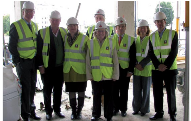
A hard hat tour of the Birley Centre site with representatives from Glyndebourne Productions Limited