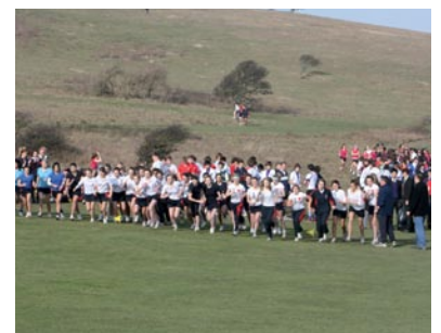
Record numbers of pupils and staff took to the Downs for the College's annual steeplechase on a day of inter-house competition won this year by Blackwater and Craig