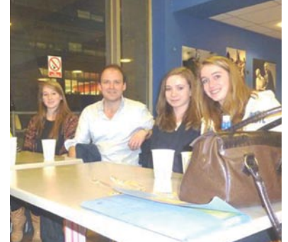
Lower Sixth pupils enjoyed a chat with actor Rory Kinnear before watching his powerful performance as Hamlet at the National Theatre

Over £1,500 was raised for MAD (the Make A Difference Foundation) by Ed Down who walked the 135 miles Glyndwr Way over six days and nights in January