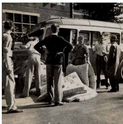
Preparing for evacuation