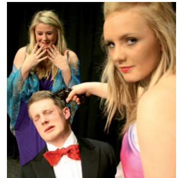
AS production of Winners!