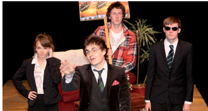
A2 production of Meeting Hertz Plinge