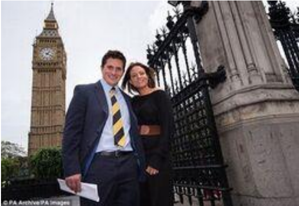
Johnny Mercer MP for Plymouth Moor View and leading advocate for mental health issues