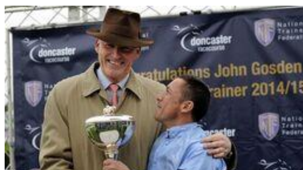
John Gosden Racehorse trainer, recent winner of Prix de L'Arc, pictured with Frankie Dettori