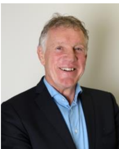
Maurice Trapp President of New Zealand rugby, former Auckland coach