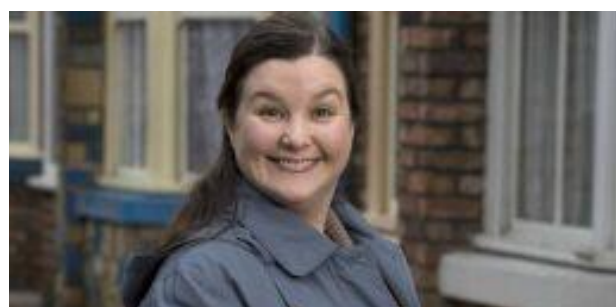
Patti Clare Played Mary Taylor in Coronation Street, three times winner of Best Comedy award