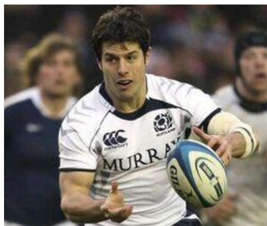
Hugo Southwell Rugby player, earned 59 caps for Scotland