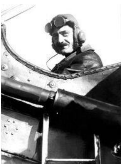
Lt-Col Frederick Minchin CBE, DSO, MC who died attempting the first East- West transatlantic flight