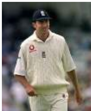
Ed Giddins England cricketer