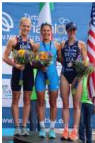
Chloe Cook GB triathlete and Olympic hopeful