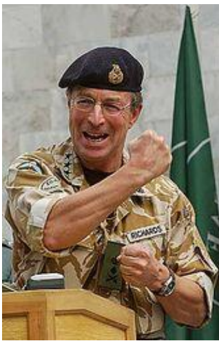
Lord Richards Chief of Defence Staff, head of British Armed Forces