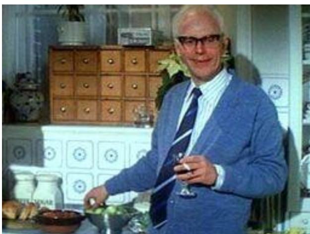
John Wells Prolific actor/satirist, pictured as Denis Thatcher in For Your Eyes Only