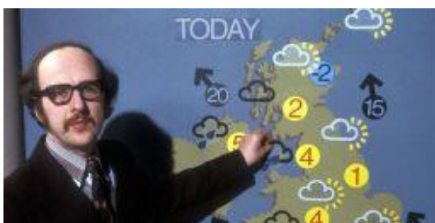
Michael Fish Weather forecaster for BBC and Met Office, author