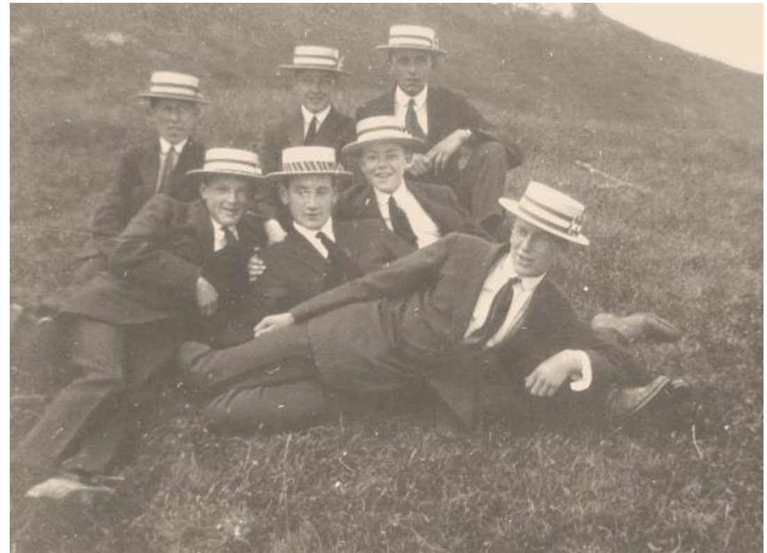
Boys in boaters (known as 'bashers')