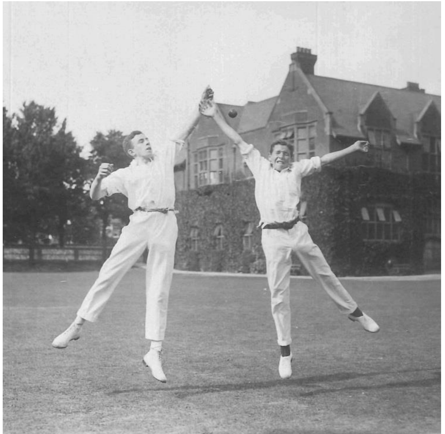
Cricket on College Field, 1917