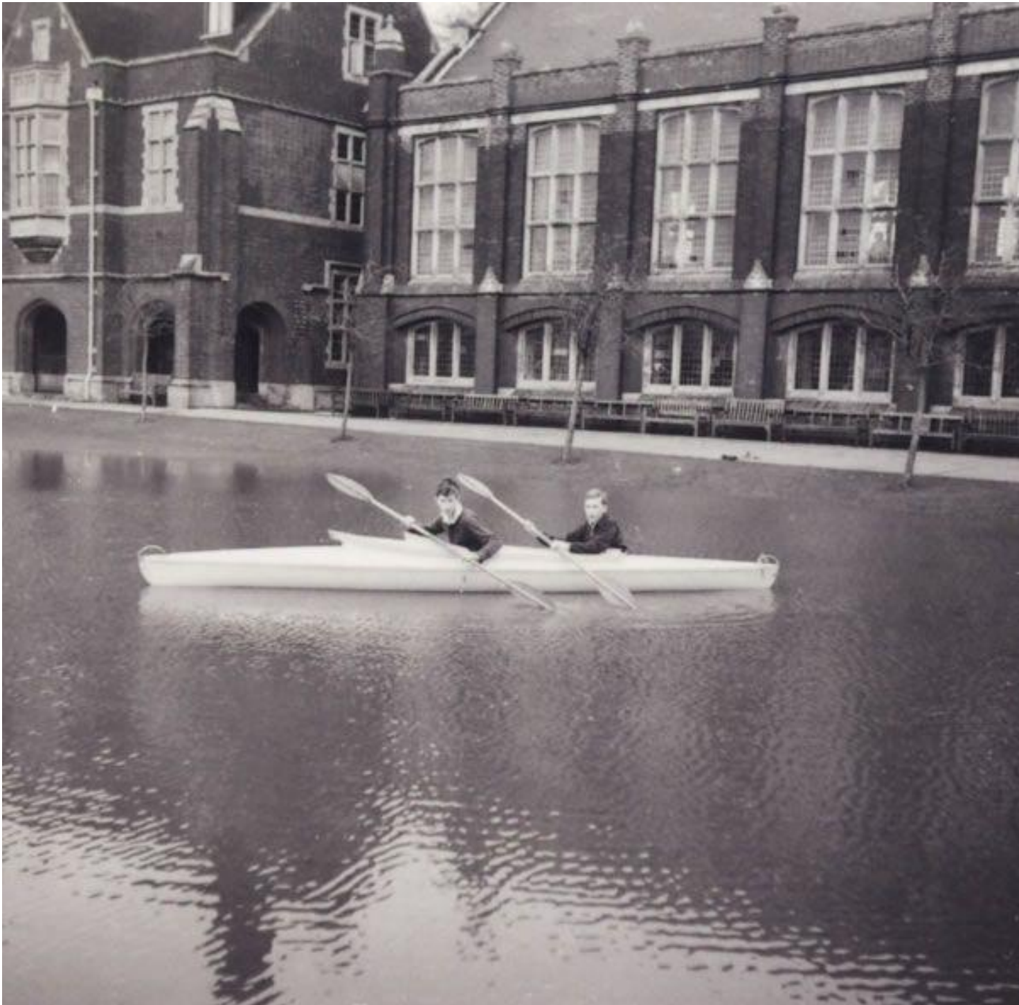
Canoeing on a flooded College Field, 1961