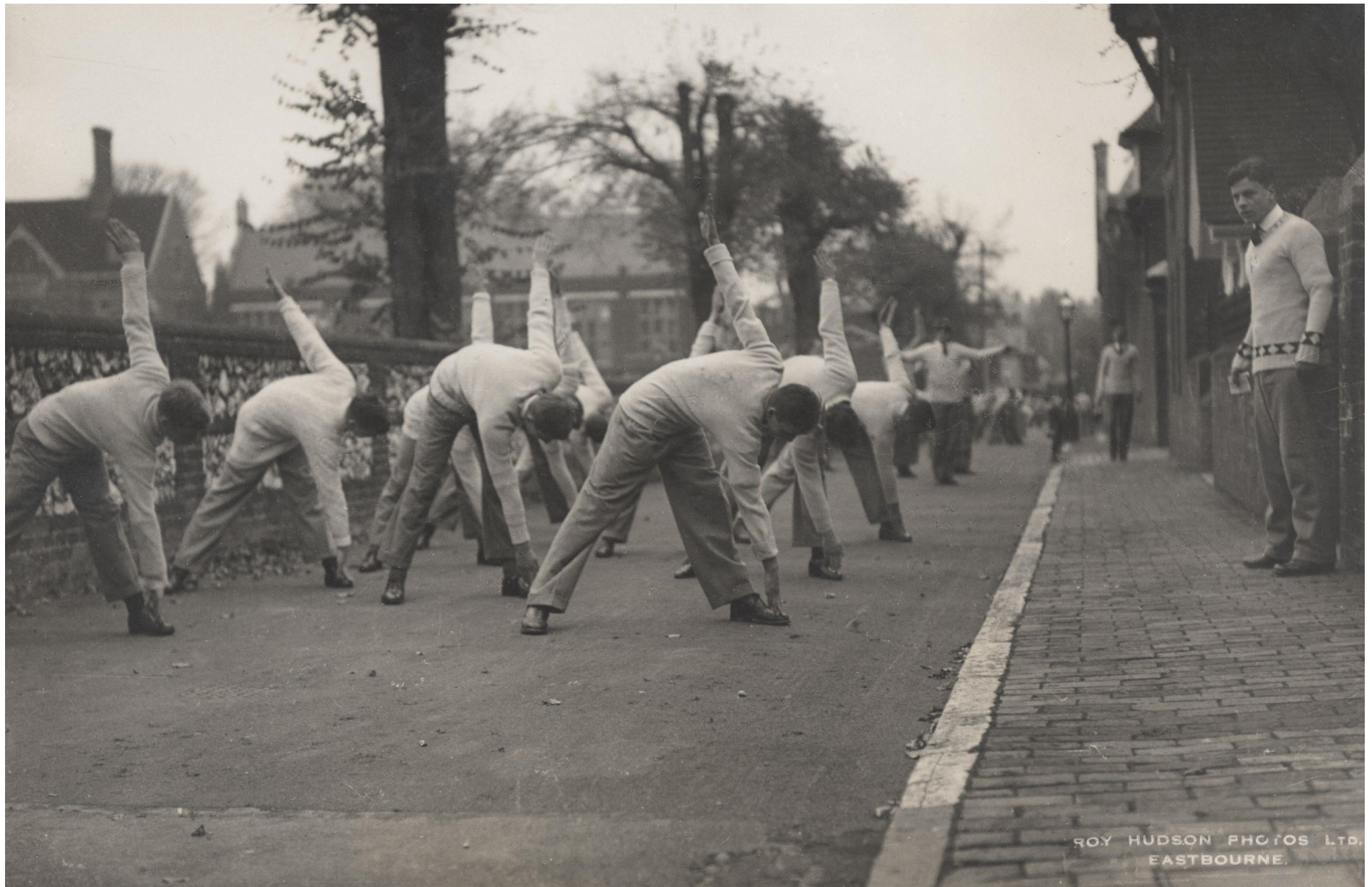
Physical training in Old Wish Road, 1930s