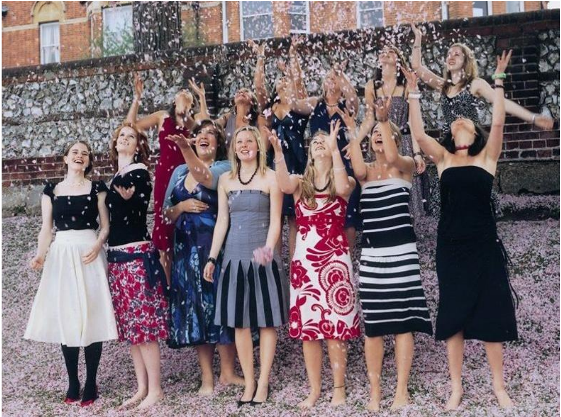
Nugent House leavers celebrating, 2006