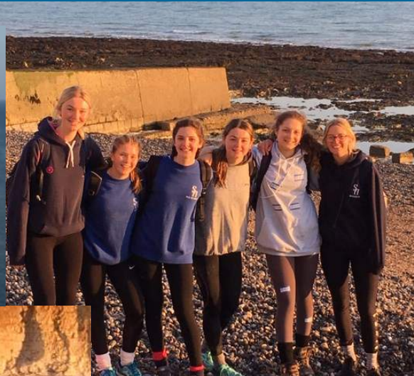
Above clockwise from left: the beautiful Sussex cliffs; under a setting sun we kept on walking; a slight detour taking us across a beach; and Brighton in sight!