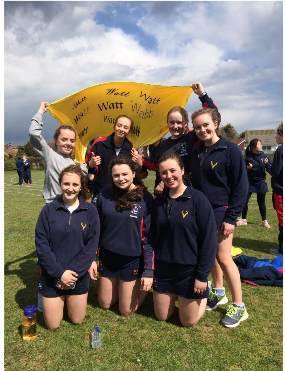
Sports day, 2016