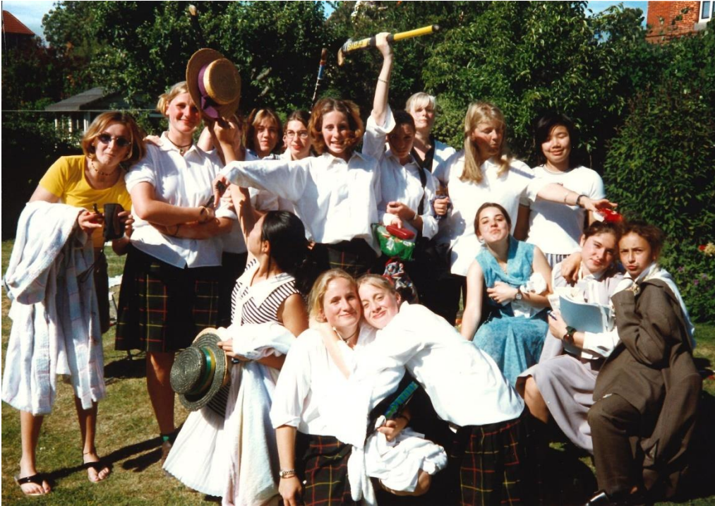
Watt House play, 1997