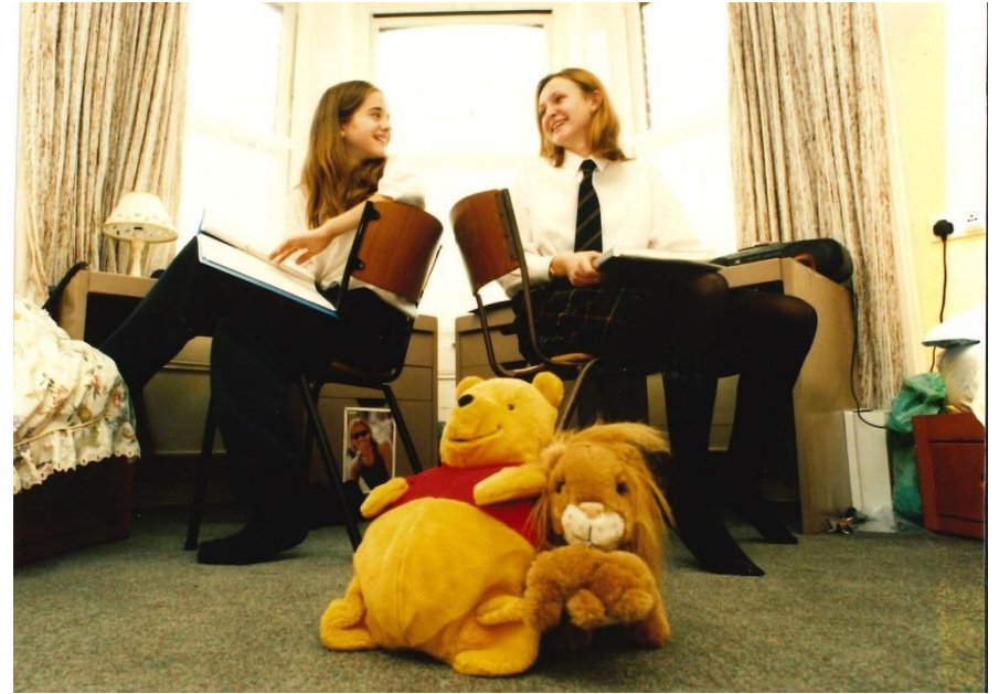
Watt House leavers dinner in the house common room, summer 1997