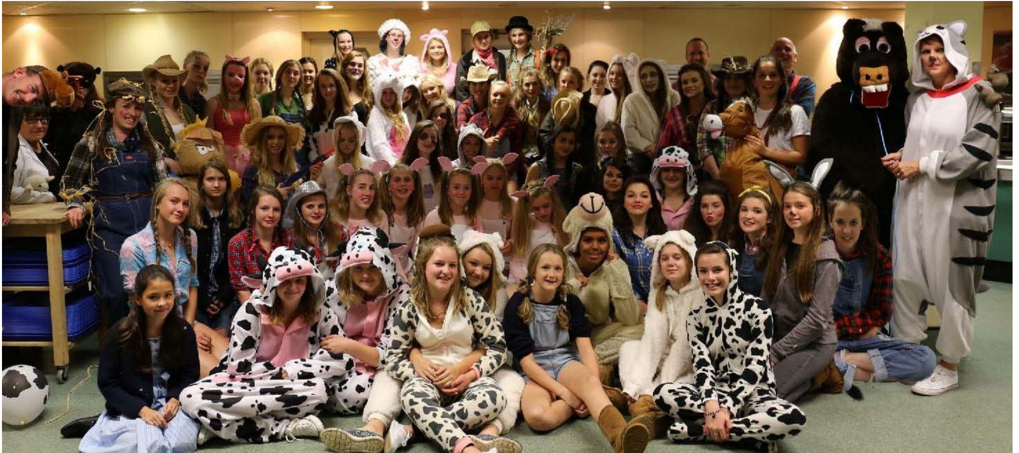
Santa Paws house dinner, Christmas 2014