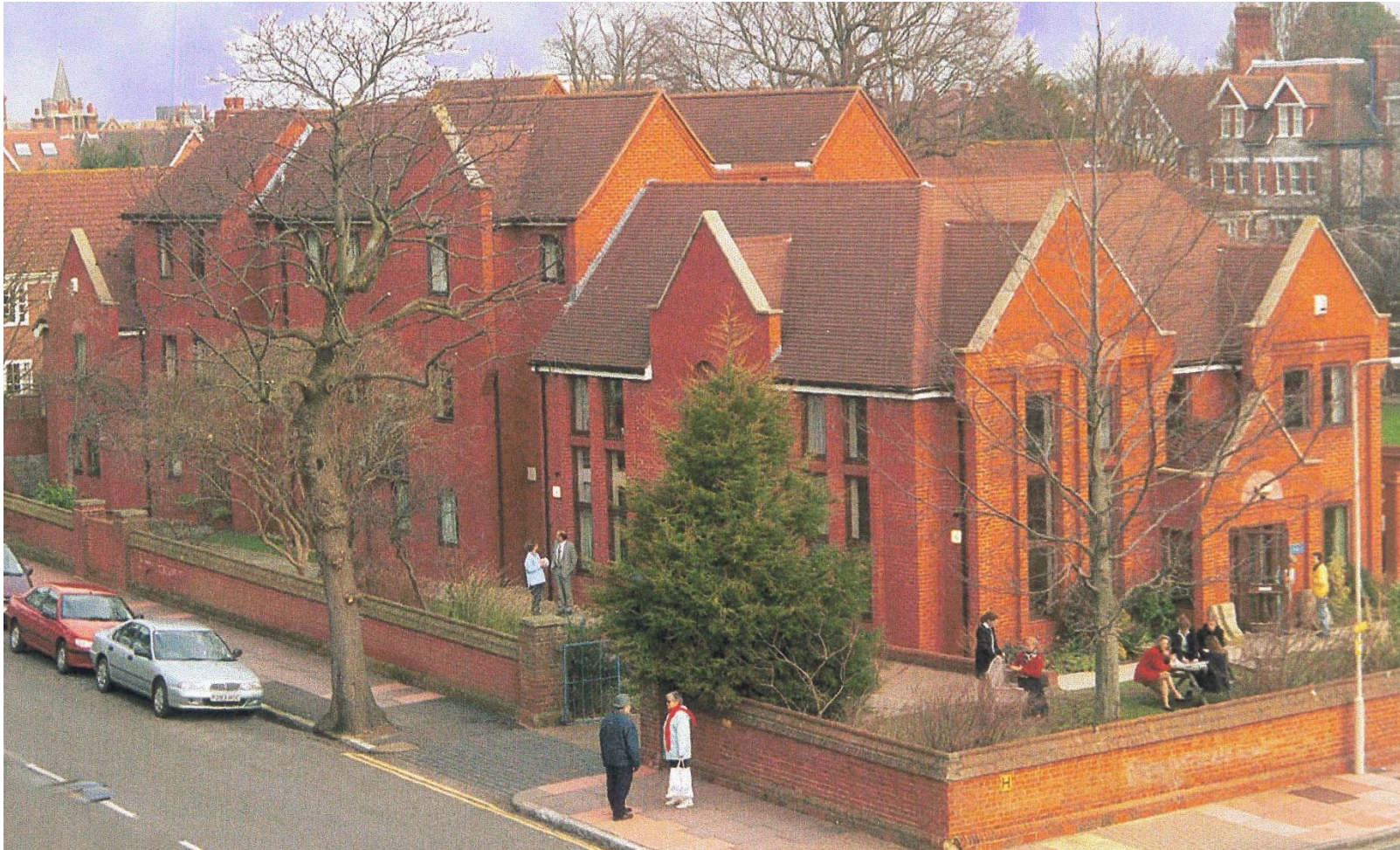
The new Blackwater House on the right with the former Green Lodge (built in 1987 as part of the former boys Blackwater house) on the left