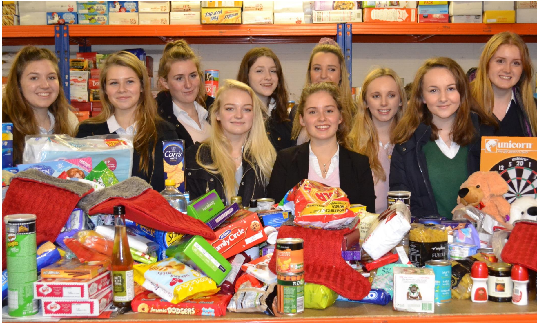
Collection for the Eastbourne Foodbank appeal