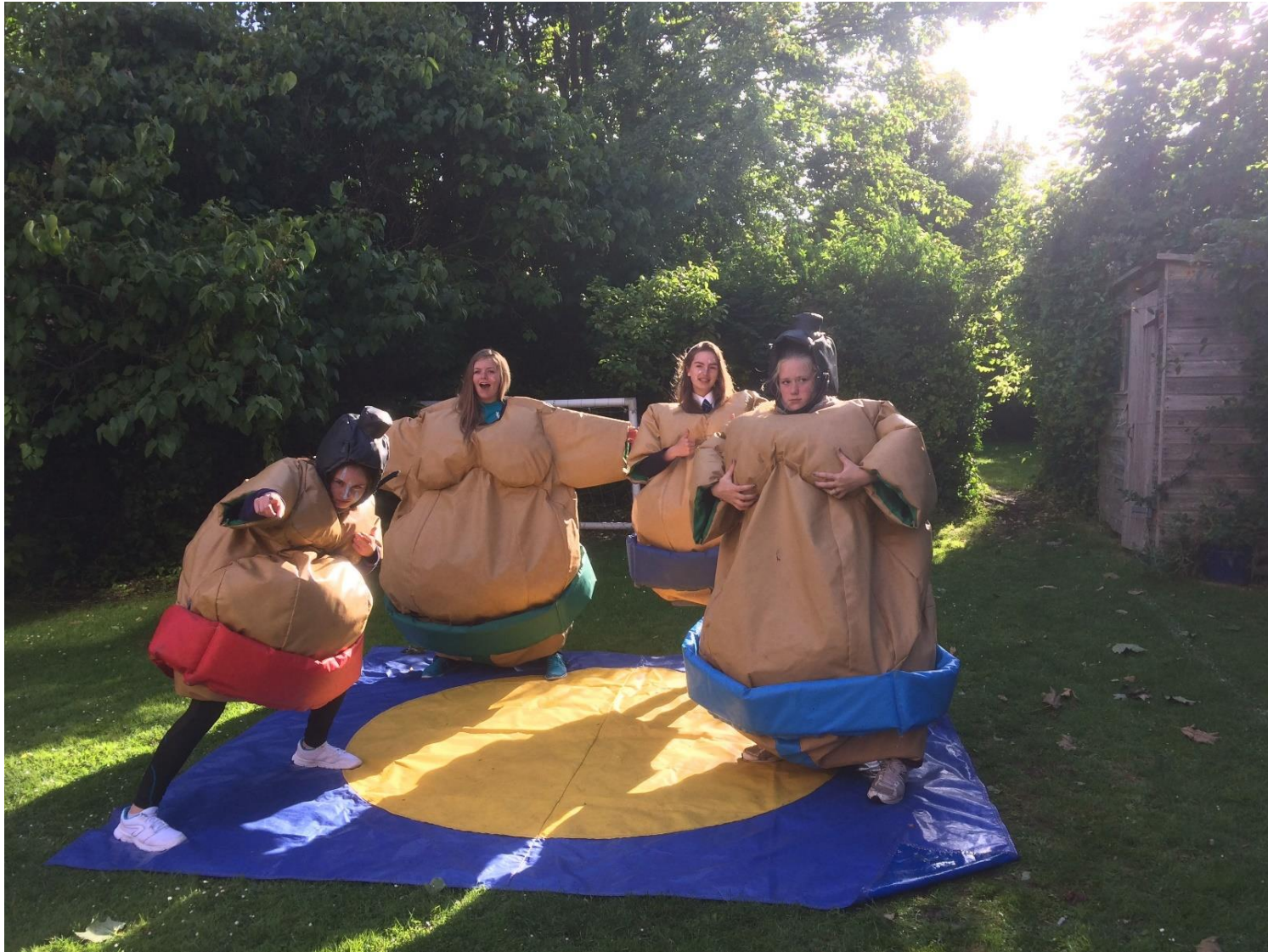
Fun in the garden