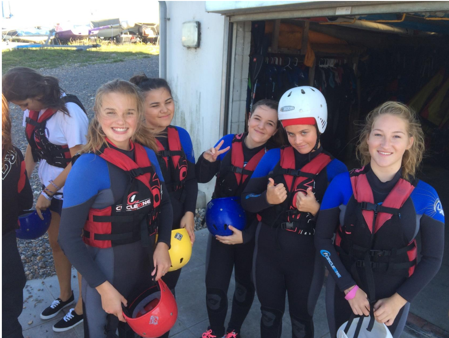
Lower Sixth rafting team