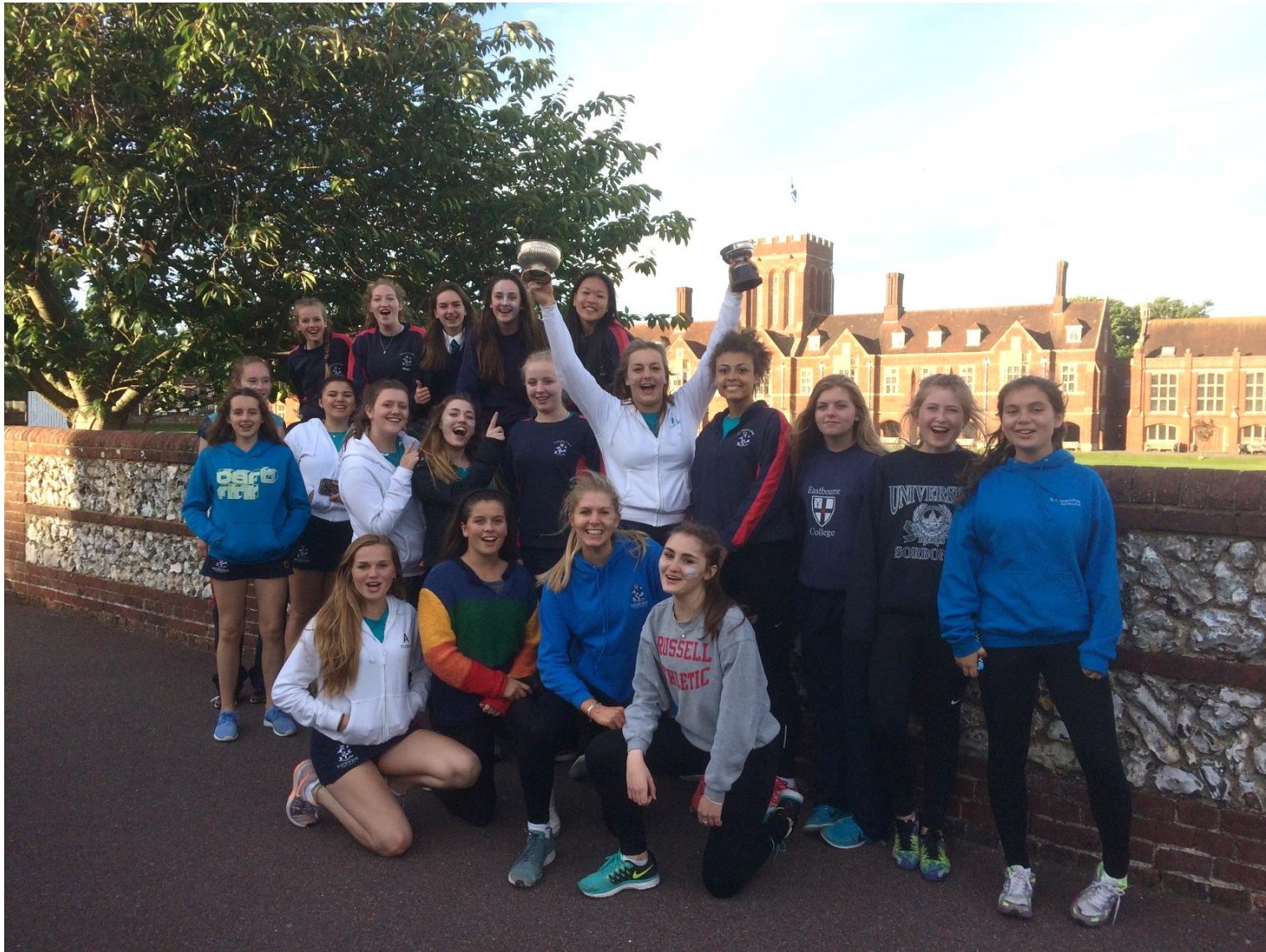
The Parlov team