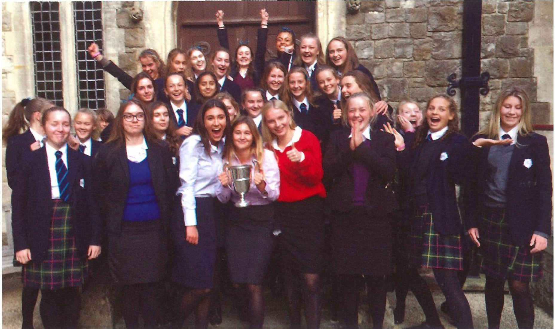
House singing winners