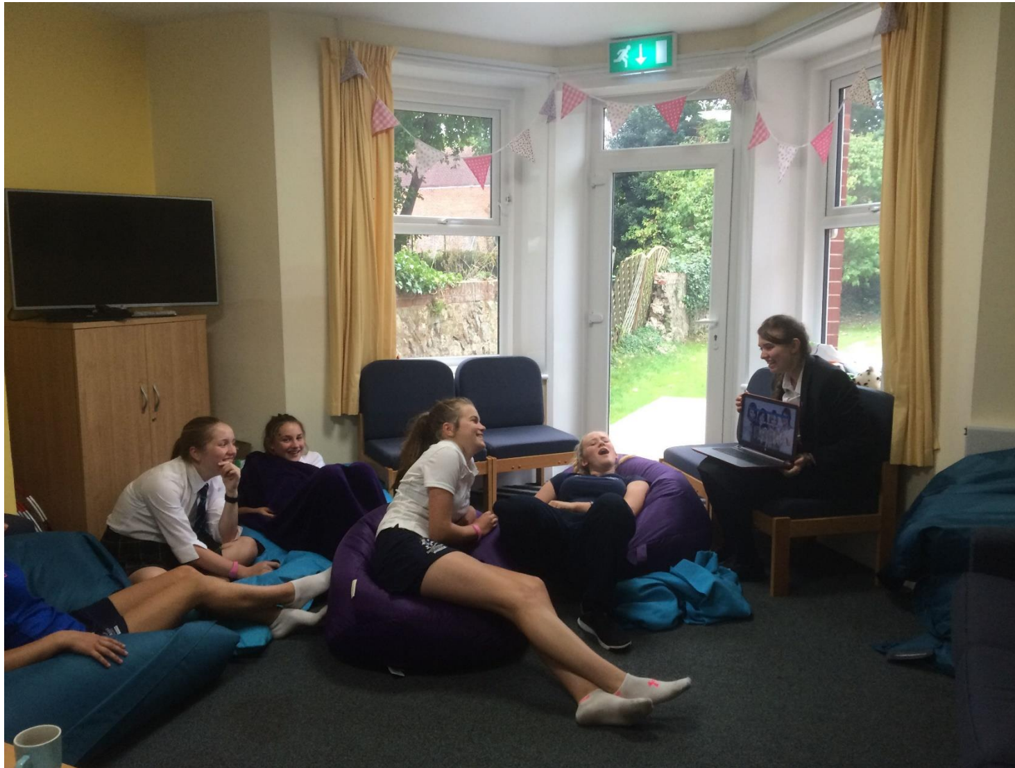
Relaxing in the house