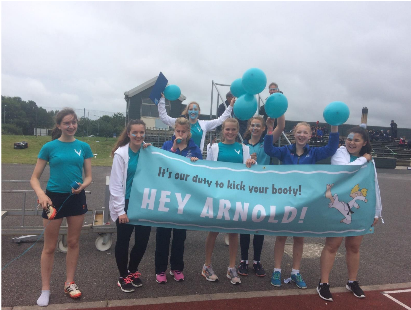
Winners of Athletics day