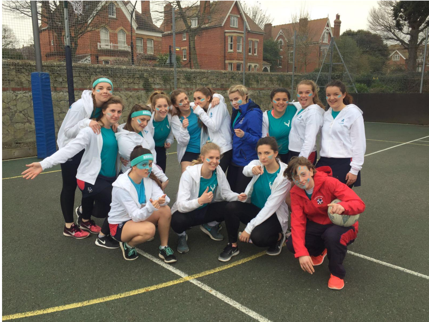
Senior netball teams