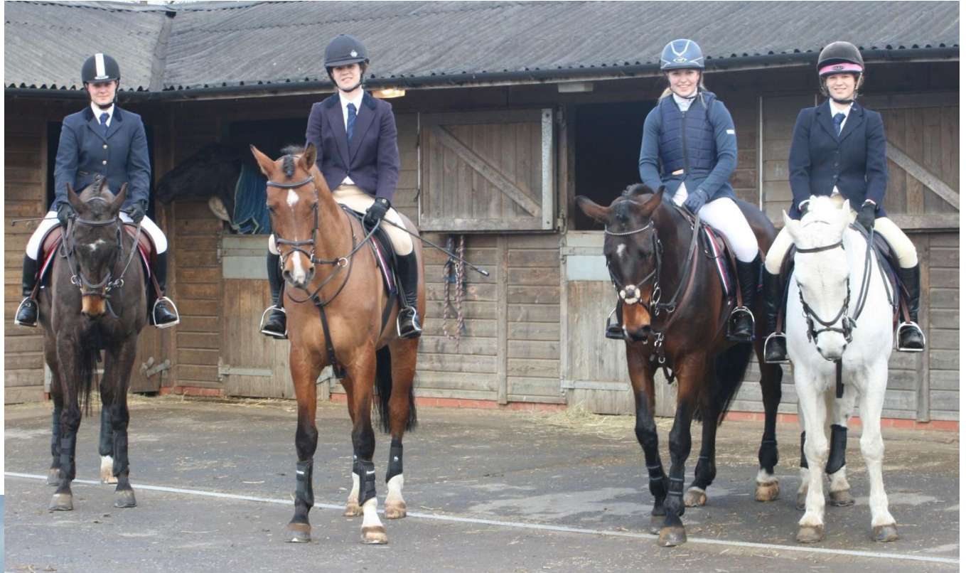
Above: The College equestrian team, 2013