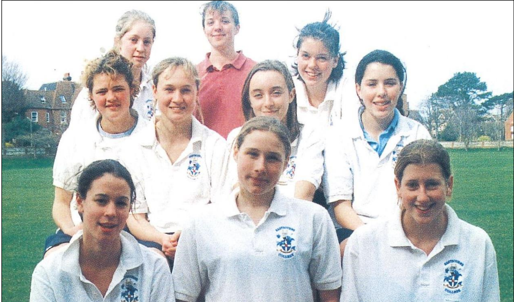
The U15 netball team won the Sussex Independent Netball Association Tournament in 2000