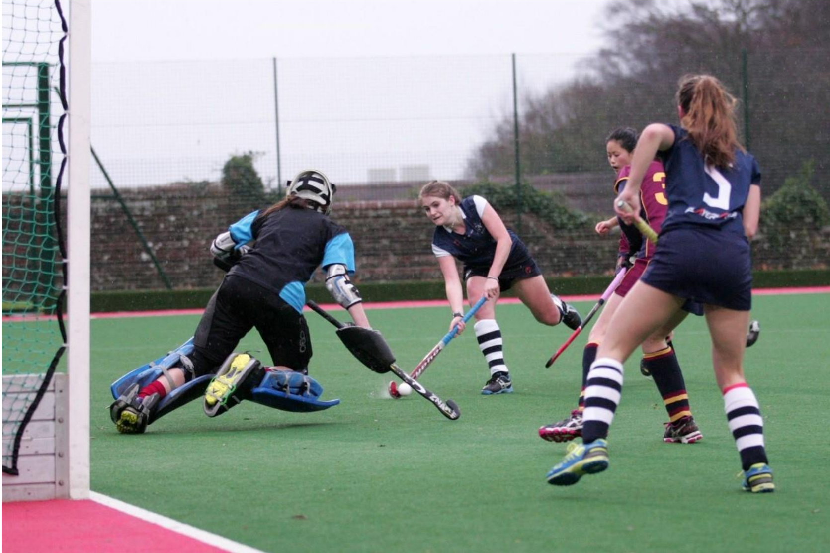
1st XI Hockey 2017