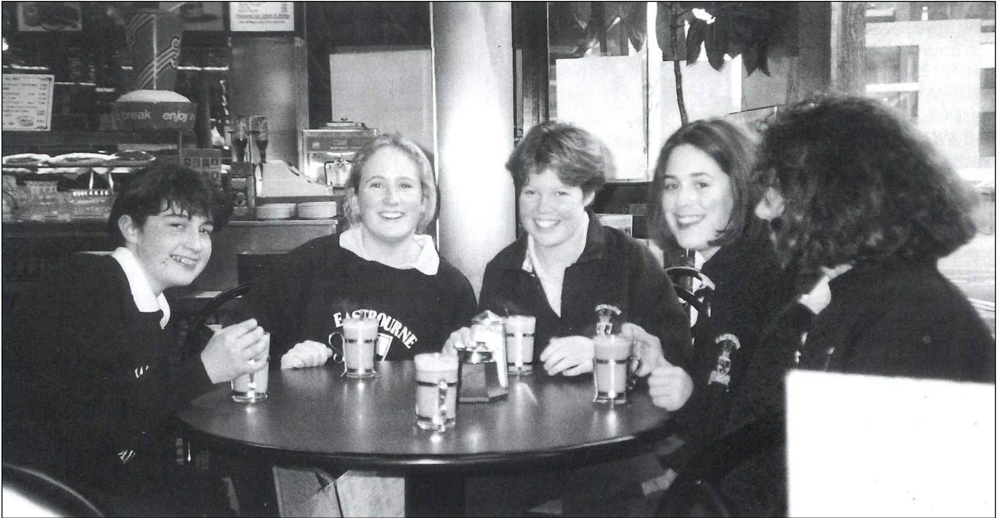
1995-96: Year 9 girls relaxing after the steeplechase