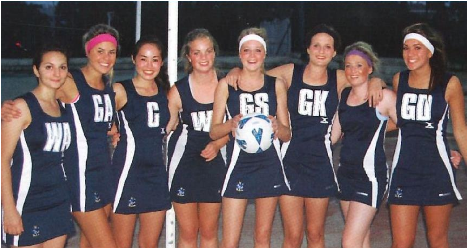
The 1st VII netball team travelled to Malta for their inaugural international netball tour in 2008