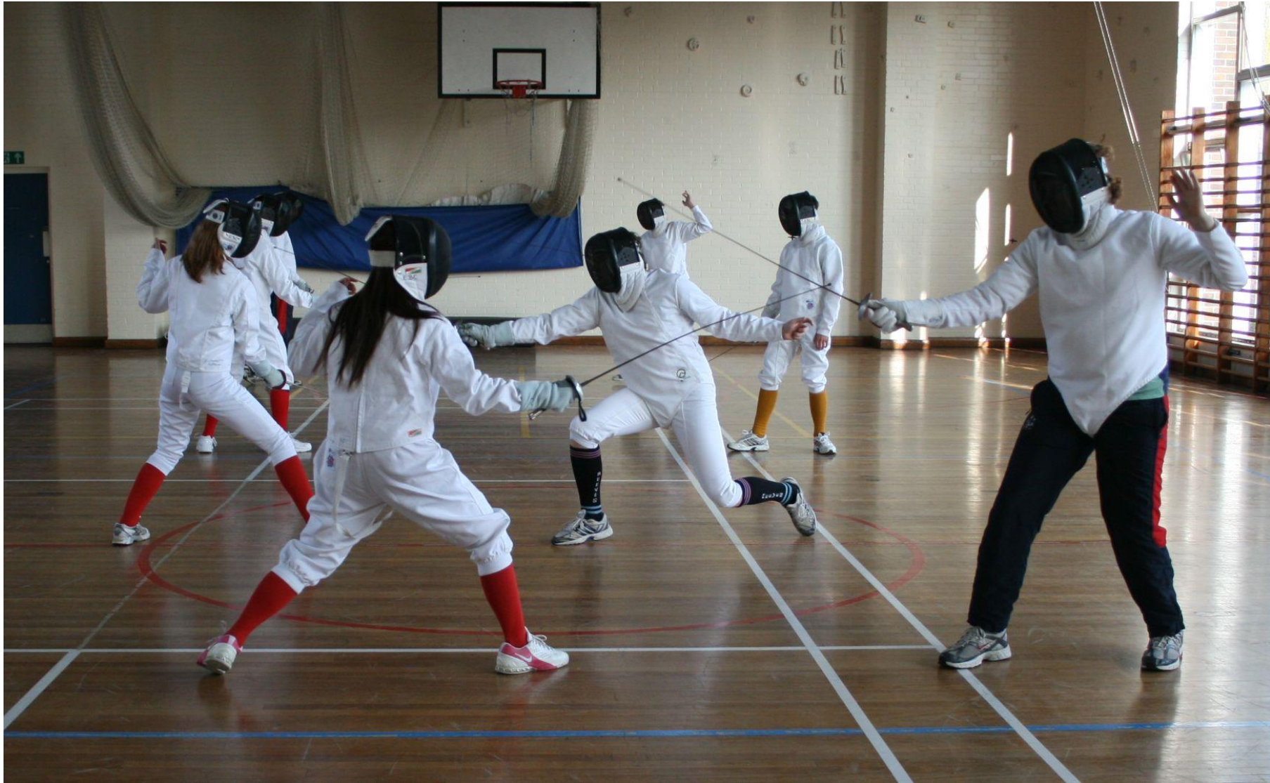
Fencing in the old gym, 2011