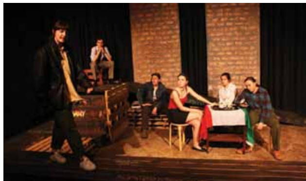
A View from the Bridge