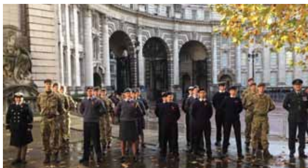
CCF in front of Admiralty Arch, Remembrance Sunday

With over 320 cadets and 25 officers the College Combined Cadet Force remains one of the largest tri-service units in the country. The College had the honour of being chosen to represent the CCF nationally at the Cenotaph on Remembrance Sunday to mark the 100th anniversary of the Armistice. Twenty cadets from all three sections, and all four year groups, marched in the televised parade.