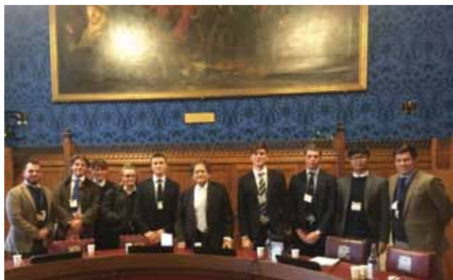
College Geography pupils with Lord Lawson

Upper Sixth pupils had a guided tour of the Houses of Parliament followed by a discussion on climate change with Lord Lawson and