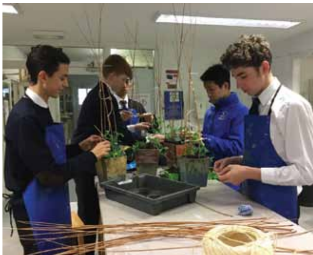
Pupils planting ceramic pots which they made for The Chaseley Trust

One hundred and ten members of the Lower Sixth have been involved in a wide range of activities at the College and in the local community including helping the elderly, the disabled, children in primary and secondary schools and in charity shops. On campus, pupils have been involved in coaching junior-school sport, and with drama and conservation projects. During the coldest months of the year, a dedicated team was involved in setting up the Winter Night Shelter for homeless people at All Saints' Church. The Amnesty International group has been campaigning for human rights and organised for a representative from Eastbourne Networkx to speak in Chapel about their work with refugees living in the local area. Members of the gardening group have been busy making ceramic glazed pots to embellish the gardens at The Chaseley Trust, where they have also been planting and maintaining flower beds, and the green team have been involved in environmental projects, including