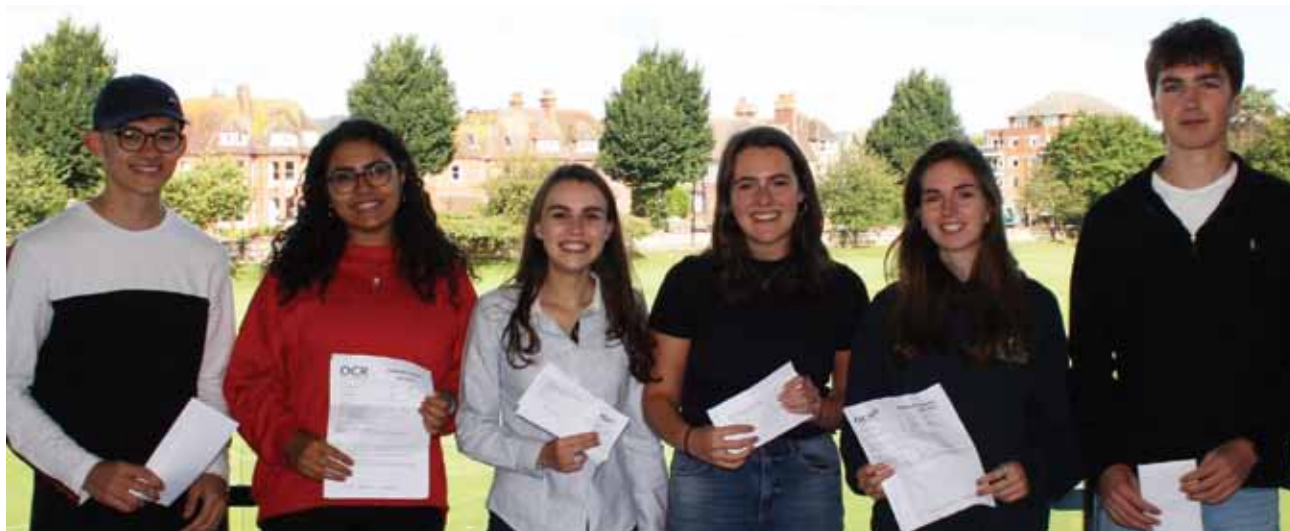
Pupils celebrating 2019 exam results

The results achieved by our boys and girls are consistently higher than many much more selective schools. Our value-added performance places us in the top tier of all UK schools.