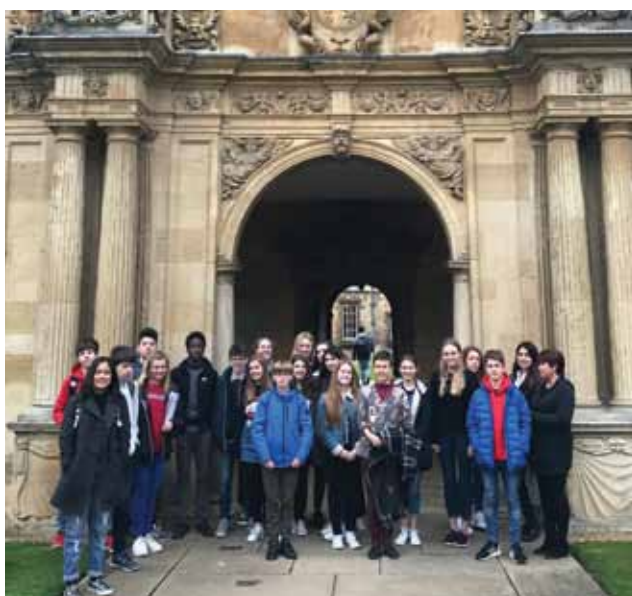
ESP trip to St John's College Oxford