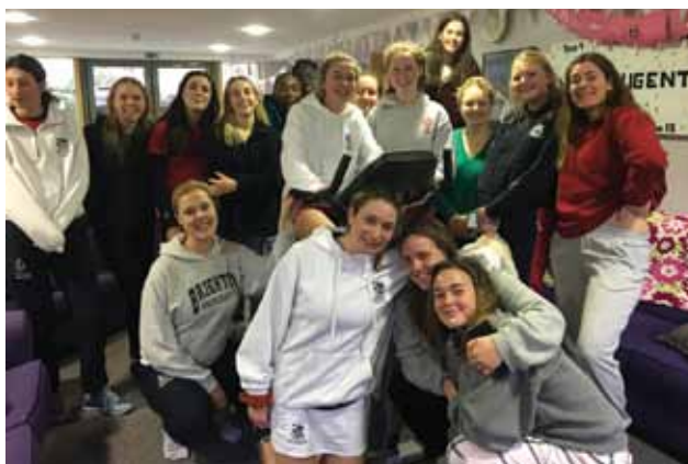
Nugent 24-hour bikeathon