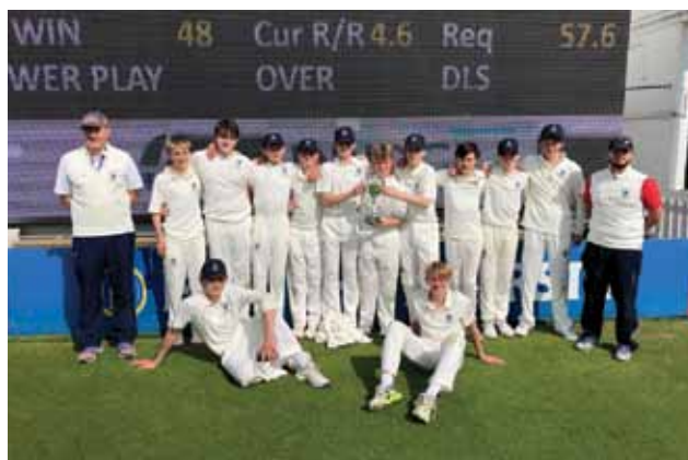
U14 county champions

The 1st XI won 16 out of 20 matches, including a victory over the MCC, and scoring over 400 for the first time in the College's history in