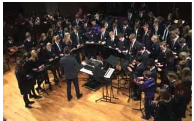
Year 9 iPad orchestra