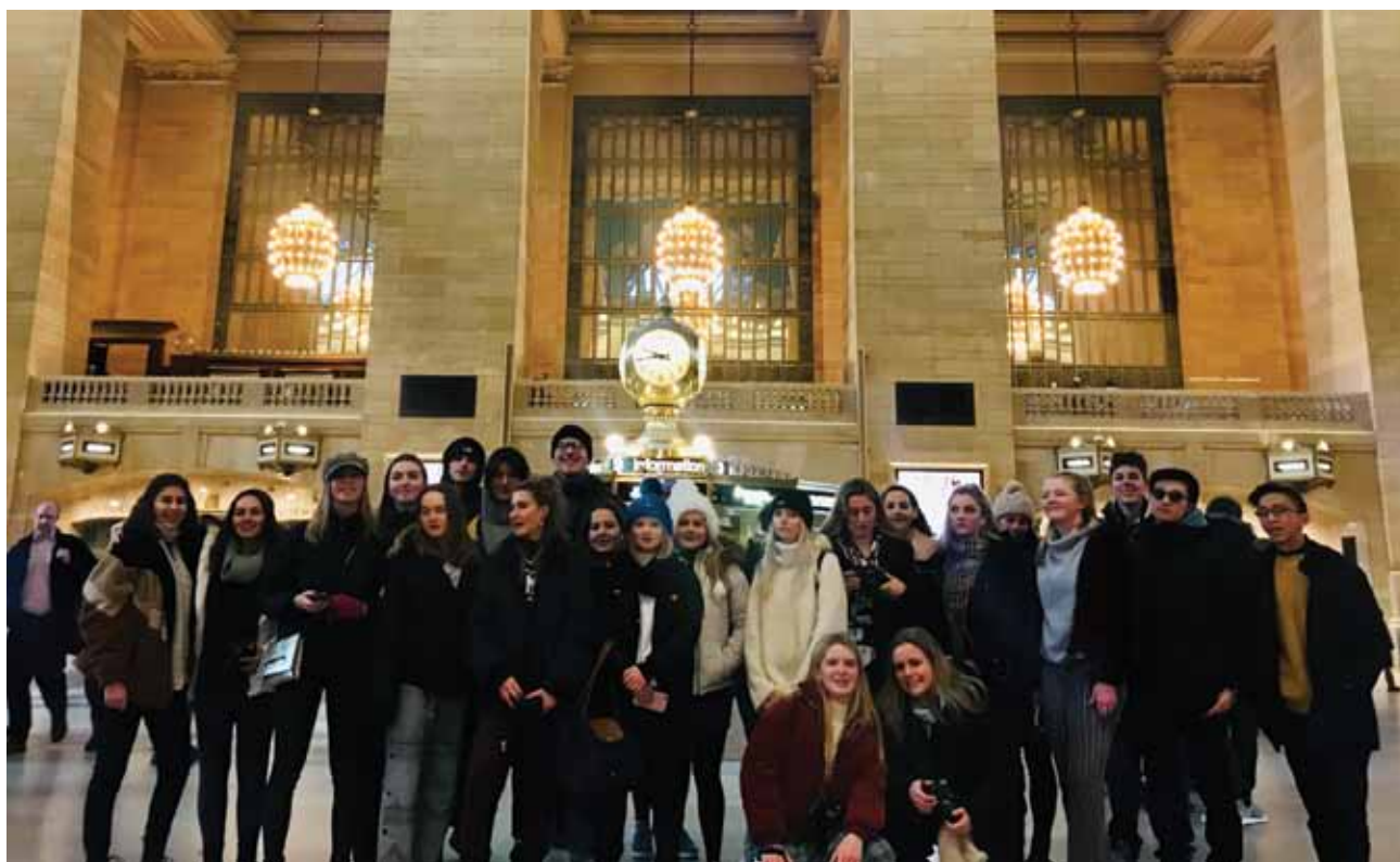
Creative arts trip to New York