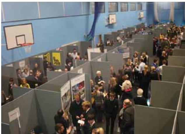
Futures Convention 2019

Every year pupils are able to take advantage of a wide range of careers events and networking opportunities, as well as receive expert advice and guidance on further education.