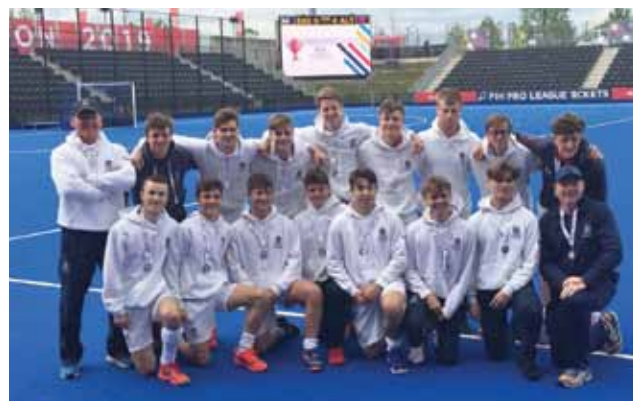
Boys 1st XI National Plate finalists