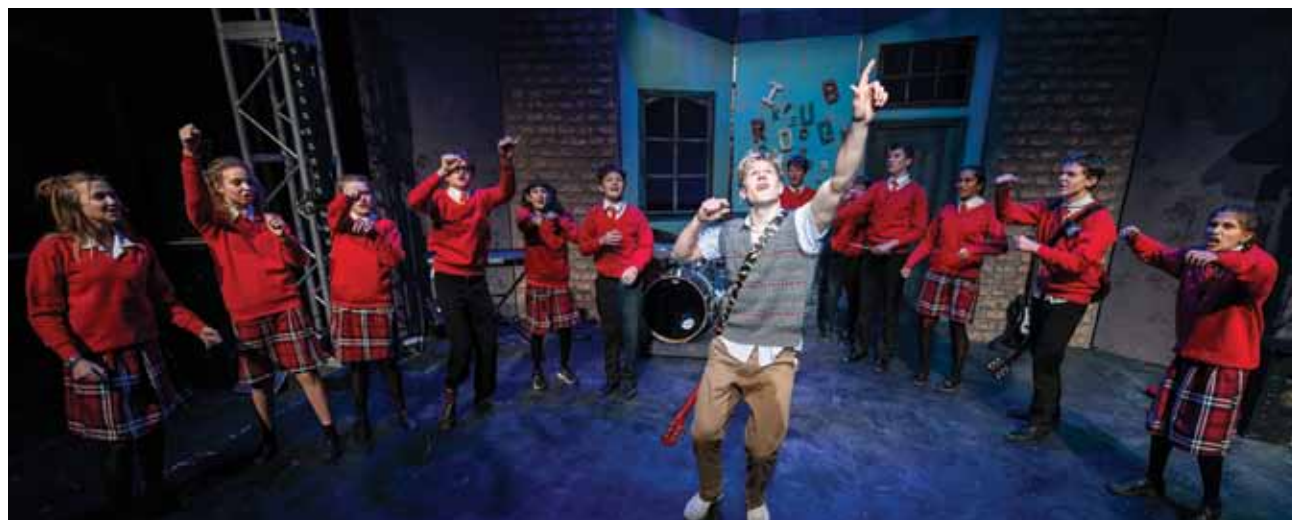
School of Rock

At the College we celebrate young people's creativity, nurturing and developing their skills from the day they arrive. Pupils work with top professionals across all the creative fields.