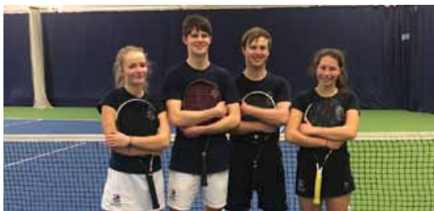
The senior mixed doubles team, third in the LTA national seniors competition

Senior girls tennis reached the semi-finals of the national Independent Schools championships, and the quarter-finals of the All British Schools championships. They also won the summer Sussex U18 schools title. The senior mixed doubles team finished third in the LTA national seniors competition. The girls team competed in the Sussex Ladies Club winter league for the first time and won their division. The U15 girls team won the County Schools