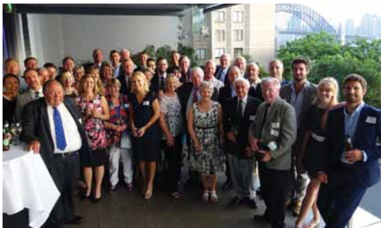
Eastbournian Society meeting in Sydney