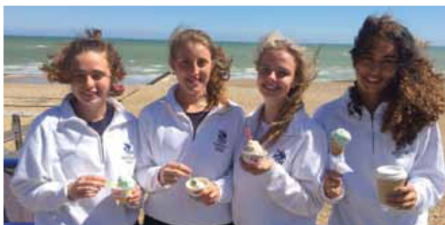
U18 tennis county champions

Senior girls tennis reached the semi-finals of the national Independent Schools championships, and the quarter-finals of the All British Schools championships. They also won the summer Sussex U18 schools title. The senior mixed doubles team finished third in the LTA national seniors competition. The girls team competed in the Sussex Ladies Club winter league for the first time and won their division. The U15 girls team won the County Schools