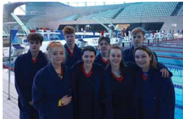
Swimming squad at the national Bath Cup

Competing against 150 schools at the national Bath Cup in the Olympic Pool, the boys reached the finals of the freestyle finishing seventh and the medley finishing ninth. The girls finished 12th overall.