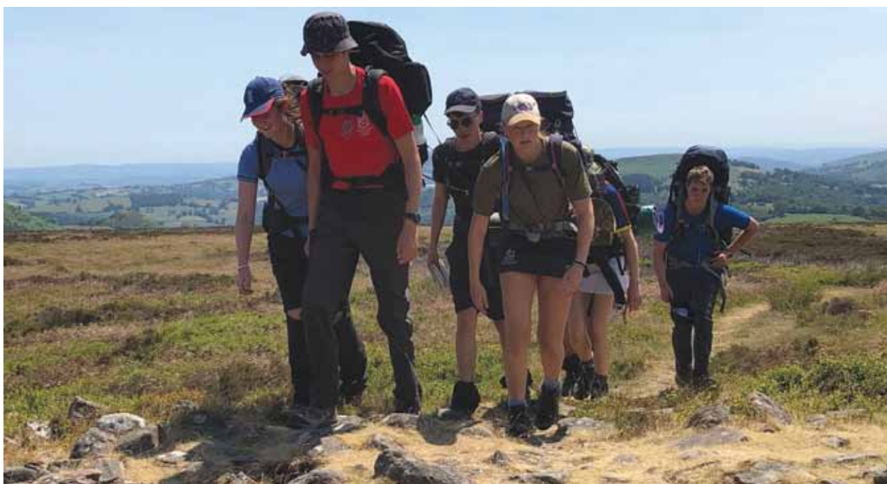
Gold Duke of Edinburgh group walking on the Black Mountains in Wales

Thirty-two pupils worked towards their Gold and 64 towards their Silver awards. The College continues to have one of the highest Gold completion rates in the South East