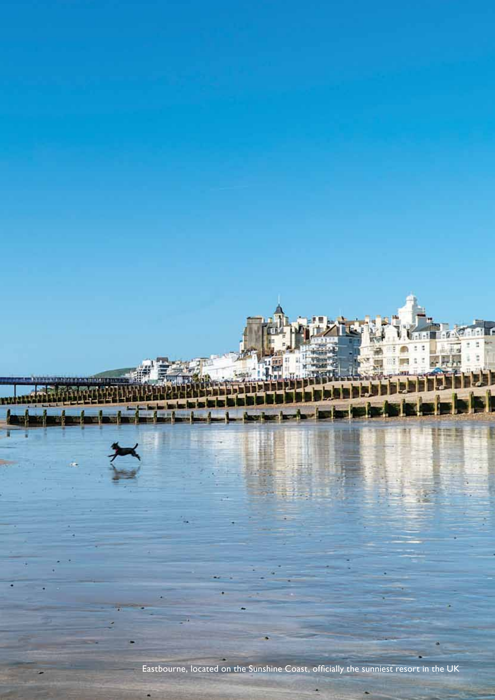
Eastbourne, located on the Sunshine Coast, officially the sunniest resort in the UK