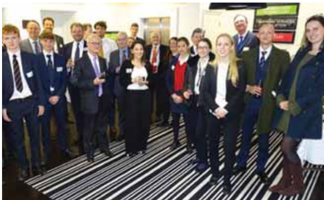
Legal networking at Lincoln's Inn

Over 250 pupils have had the chance to engage with industry professionals ranging from the creative sector to planning and engineering to law. The College has welcomed representatives from over 20 universities who have spoken collectively about the opportunity that university can offer. We have welcomed speakers and organisations who champion study outside the UK, support gap-year planning and who help advise pupils preparing for the world of work.