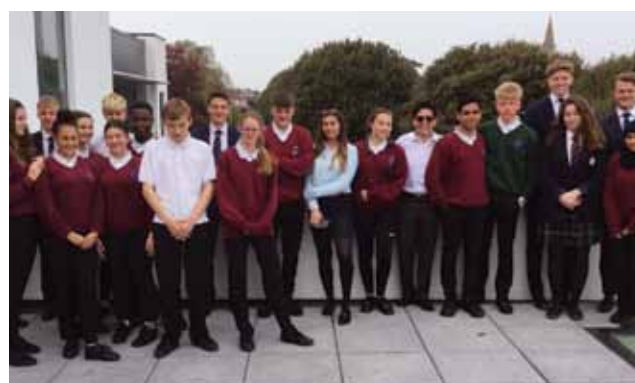
ESP MFL Conversation Club