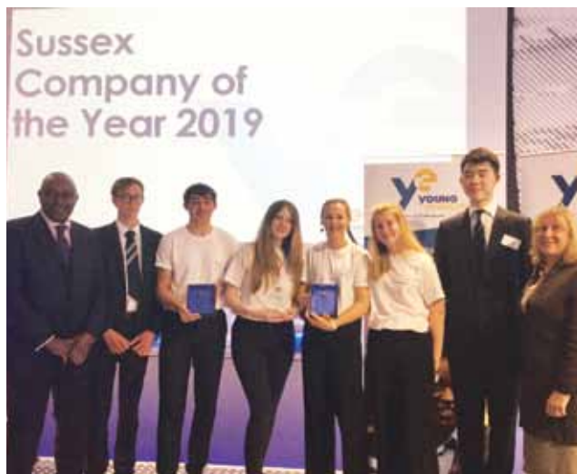
College Young Enterprise team

The College's Young Enterprise's company Unum won best website, best brand, best presentation and best overall company at the Area Showcase and Finals at the Amex Stadium, reaching the Regional Final where they finished runners-up out of all the schools in the South East