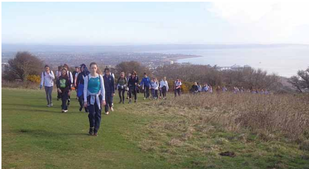
School House pier-to-pier 26-mile walk

From the day they start at the College, pupils have time to participate in a breadth of activities that enrich and broaden their experience and give them opportunities to develop teamwork, leadership and other important life skills.