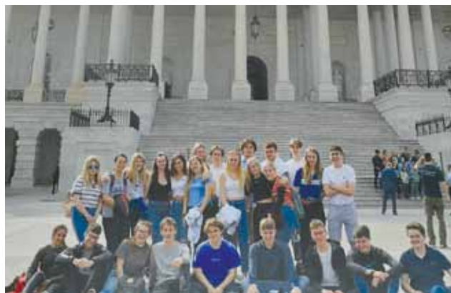
Politics trip to Congress