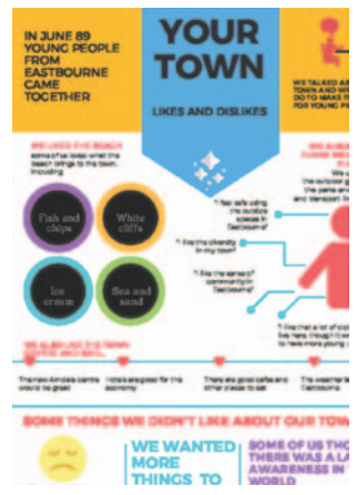
Infographic by young people; Your Town Project