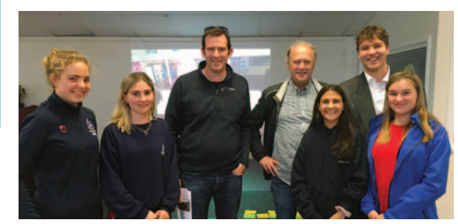
Meeting Sir Tim Smit

'I am especially drawn to your philosophy that all schools have different contributions to make; it provides an excellent model for how schools can work together for the mutual benefit of all pupils and staff. The way in which you collaborate across sectors, pool resources and share expertise offers genuinely exciting opportunities to young people, while at the same time having a real impact for good within the community."