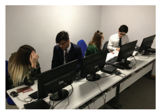
Willingdon Homework Club 2019

The pupils thoroughly enjoyed the opportunity. Feedback from them was that they really enjoyed and understood the benefits of working with high-achieving sixth form pupils. The Eastbourne College buddies provided subject-specific advice, as well as advice about preparing for exams and future career pathways. It was clearly evident that the pupils from Eastbourne College enjoyed the experience and I hope they gained a valuable experience from working with the pupils from Willingdon.