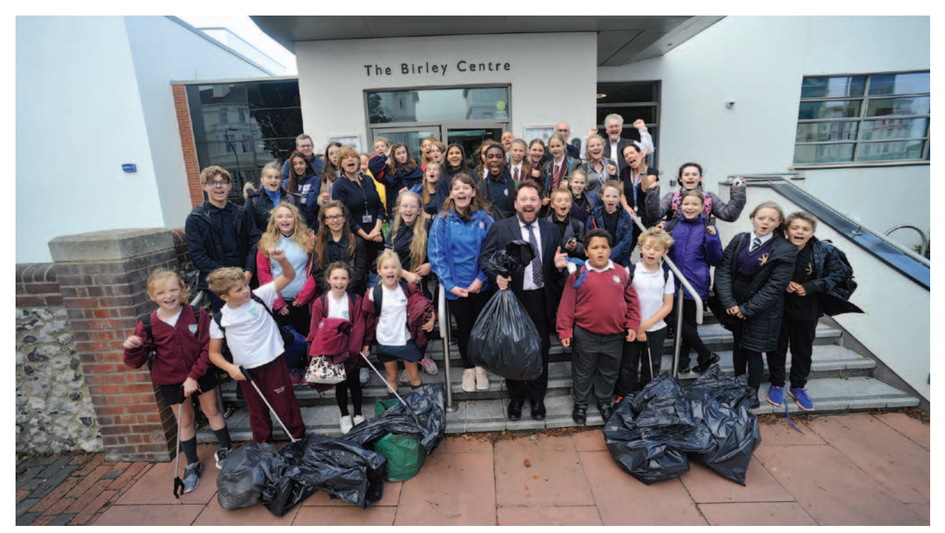
Beach Clean Day 2019