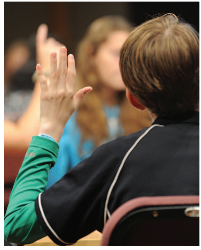
Revision Club 2019