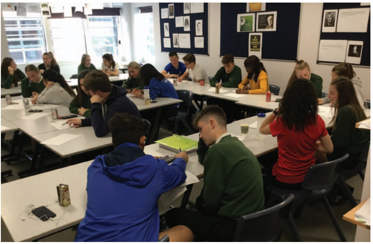
Revision Club 2019