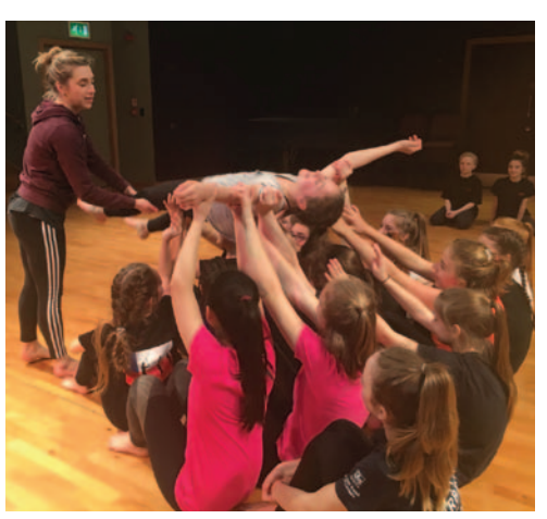
Rambert Residency 2018