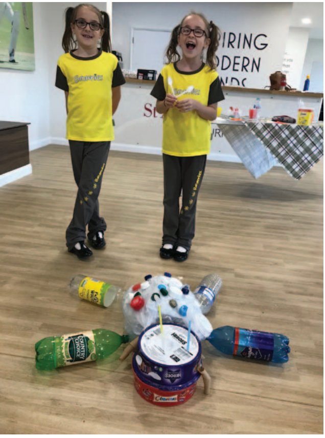
St Andrew's Brownies explore ways to reduce plastic usage 2019