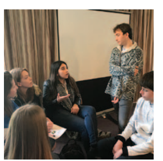
ESP St John's trip, group work, March 2019