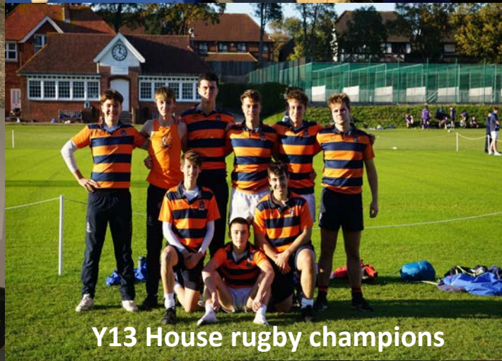
Y13 House rugby champions