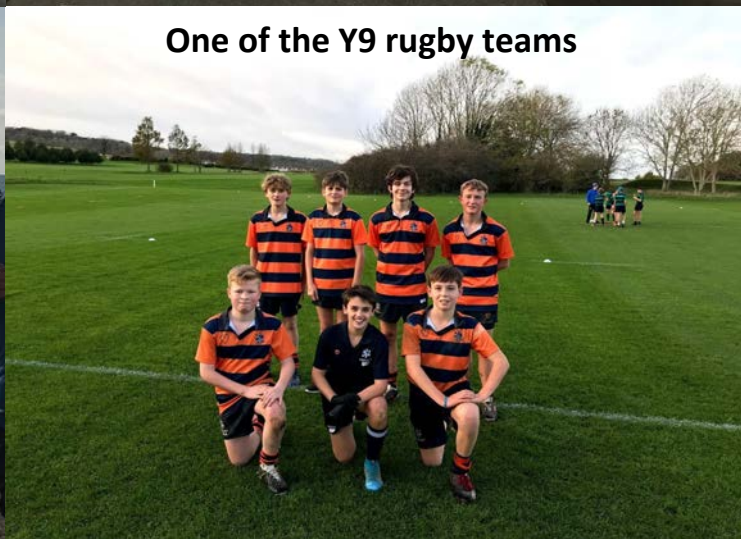
One of the Y9 rugby teams