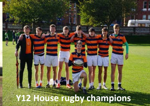
Y12 House rugby champions