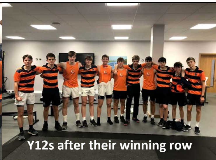
Y12s after their winning row