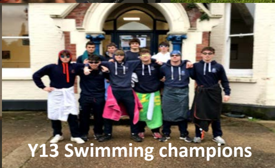
Y13 Swimming champions