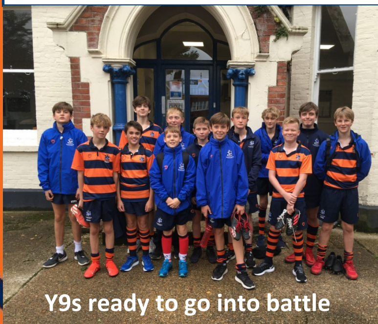
Y9s ready to go into battle