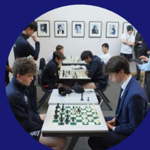
Brave chess players reach the final (p12)