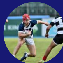
National rugby success (p4)

The house eats approx. 20 loaves of toast per week