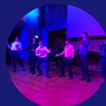
So much talent on show in the house revue (p6)