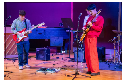
Charity and services