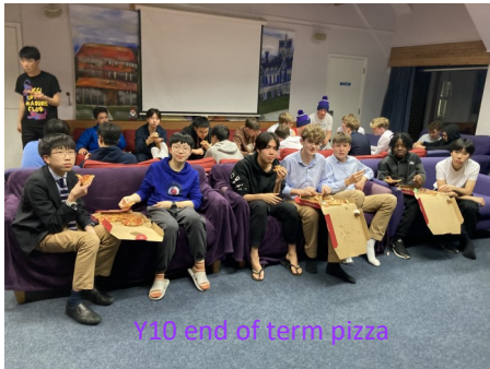
Y10 end of term pizza