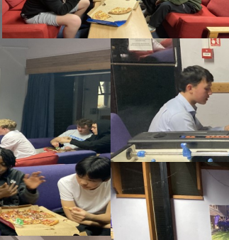
Y9 Celebrating winning