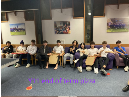
Y11 end of term pizza