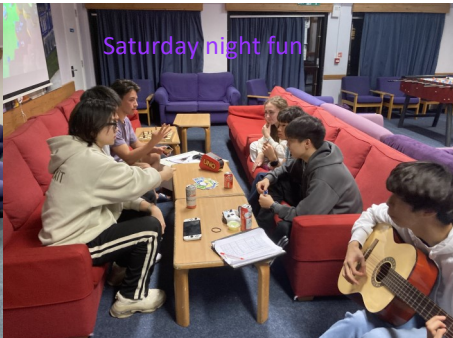
Saturday night fun