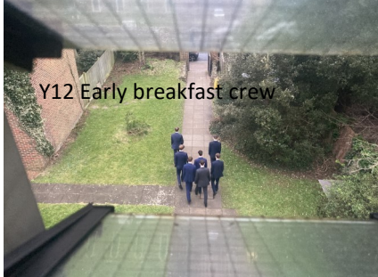
Y12 Early breakfast crew