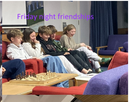
Friday night friendships