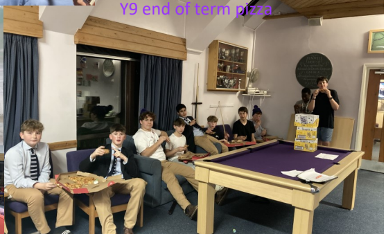
Y9 end of term pizza