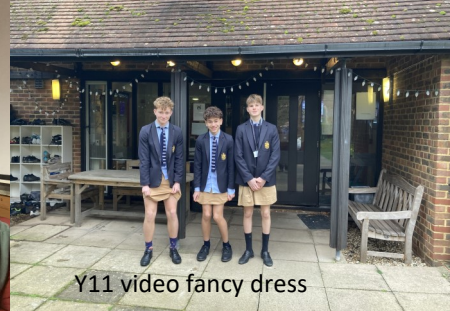
Y11 video fancy dress