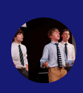
Proud a Cappella performance (p4)

The number of fixtures over 17 sports during the term